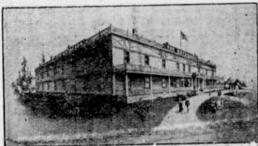
THE ESTACADA HOTEL

A REAL HOME PLACE LIGHTS ALWAYS LIT FIRES NEVER OUT DOOR IS ALWAYS SWINGING BOTH WAYS EXCELLENT SANITARY ROOMS THE TABLE ALWAYS SET ELECTRIC RANGE IS HOT IN THREE MINUTES