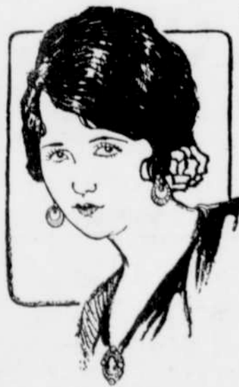
Mebe Daniels in the Realart Production "A Game Chicken"