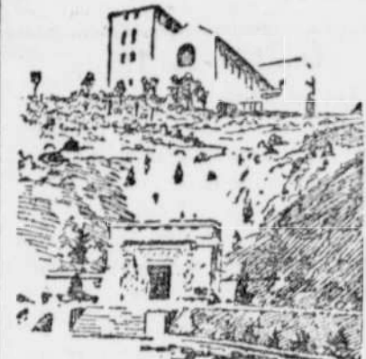
Entrance Made Easy.

Something unique has been accomplished in the completion of the entrance to the Southwest museum in Los Angeles. The building is situated upon a high hill and up to the present year it has been necessary for pedestrians to make a long and laborious climb up the hill to reach the main entrance.