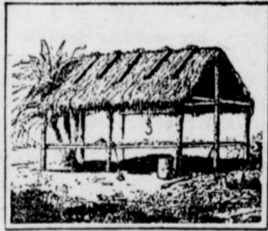
Typical Seminole House.

The Seminoles are notably handsome people and their young women are the