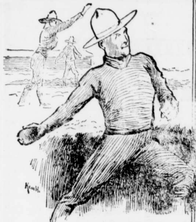
A little more of this bomb practice, and he'll be ready to sit down and enjoy a little chew of the Real Gravely the folks back home sent him.