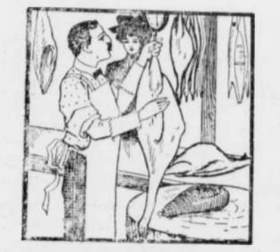
Cash Paid For Eggs

Get one now, and it will be the best you ever ate.