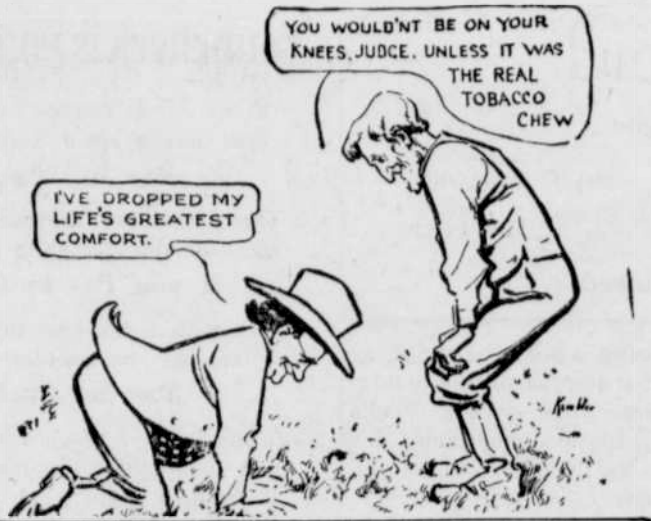
THE OLD SCHOOL TEACHER KNOWS HOW THE GOOD JUDGE FEELS

YOUR own taste and comfort tells you that "Right-Cut" is the Real Tobacco Chew .