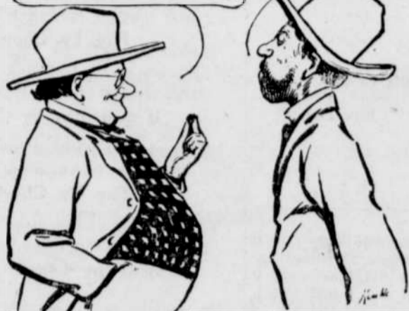
THE NOVICE LEARNS THE GOOD JUDGE'S WAY

A NIBBLE of "Right-Cut" gives you more good tobacco taste and substance than a cheekful of the old kind.