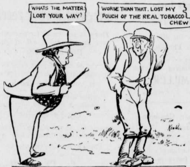
THE GOOD JUDGE FINDS THE LONELY WOODSMAN

A FTER all your years of chewing—here is the Real Tobacco Chew , "Right-Cut"!