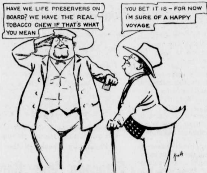
THE CAPTAIN CALMS THE GOOD JUDGE'S FEARS