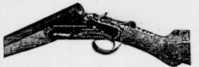
This Shot Gun $4.95