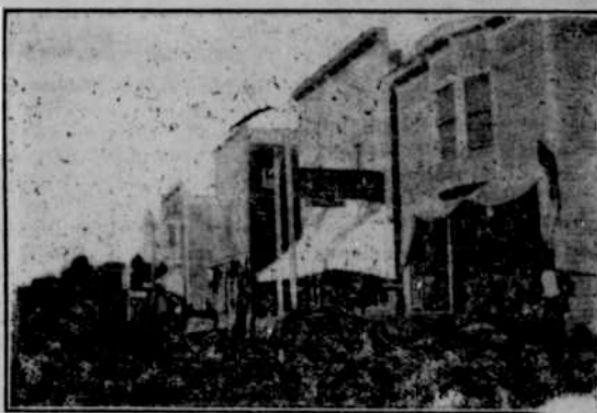
Broadway, looking North from Second St.