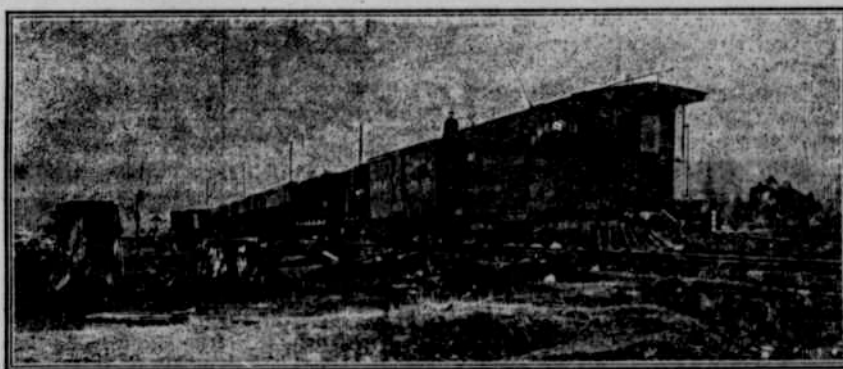
Electric freight train on the O. W. P. Railway - Fortified Estacada.

The Oregon City council is holding up the 35 year franchise the O. W. P. Company asks for.