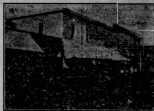
Broadway, looking North from the Railroad.