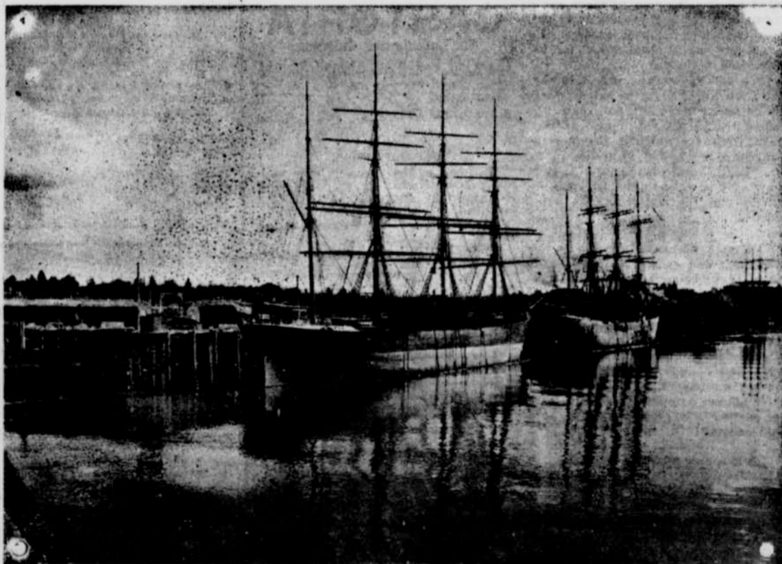
PORTLAND TERMINAL OF THE OREGON WATER POWER & RAILWAY COMPANY