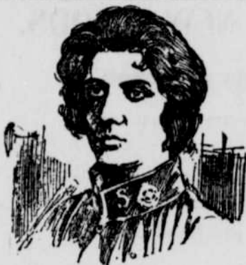
MISS EVA BOOTH.

Commander Evangeline Booth, the new head of the Salvation Army in America, is a daughter of General William Booth, and is one of the most able and brilliant platform orators of the present day and is famous as an organizer. For the past fifteen years she has had charge of the active work of the Salvation Army in Great Britain and Canada, and during that time has founded a great public school system in Newfoundland and established