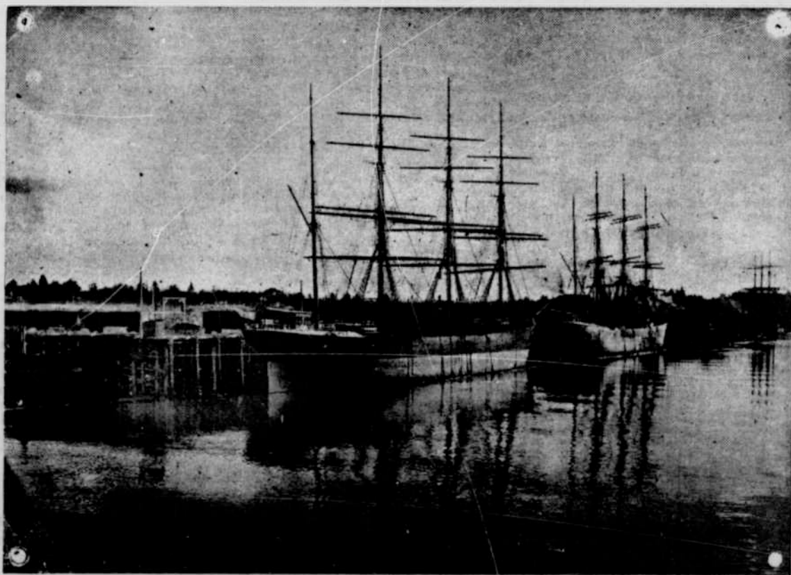
PORTLAND TERMINAL OF THE OREGON WATER POWER & RAILWAY COMPANY The Company's cars on the wharf