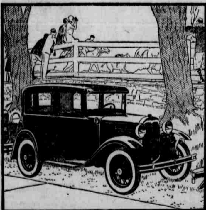
THE NEW FORD TOWN SEDAN

Ask the nearest Ford dealer for a demonstration