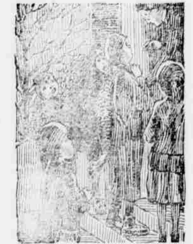
Miss Heppsie Continued to Stare.

MISS HEPPSIE'S Christmas turkey had disappeared and she had looked in every nook and cranny of the great old Padgett place, dutifully to reassure herself. She was indignantly sure that she knew who had taken her bird, although she had not really seen it go, for there had been hushed rumors of her neighbors' evil practices. Miss Heppsie had not listened very much. Lonely and prim, she lived in the house where her father was born. The changing world beyond her walls went by without her knowledge and her neighbors were strangers, except for an occasional glimpse of a pair of bedraggled children. And now she hated them.