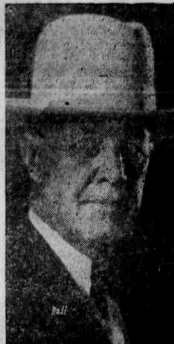
WALTER M. PIERCE

FOR UNITED STATES CONGRESS Second District