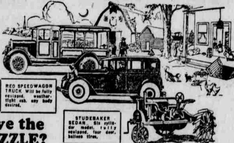
Geo Speedwagon Truck will be fully equipped, weather-tight, etc. as desired.

In the past we have given hundreds of thousands of dollars in cash and valuable prizes to advertise our business. Now we have determined to make a bigger free offer than ever to gain friends and advertise our business in all parts of the country. We are going to give a choice of either a Studebaker Sedan, a Geo Speed Wagon Truck or a Farmall tractor absolutely free of cost, because we believe that this system of advertising will not only make friends for us but will also be a great boon to the party receiving such a prize. IF YOU WOULD LIKE TO HAVE A CHOICE OF THESE THREE FINE MACHINES, READ EVERY WORD OF THIS ANNOUNCEMENT AND THEN ACT.