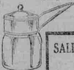
1 1/2 QT. DOUBLE BOILER