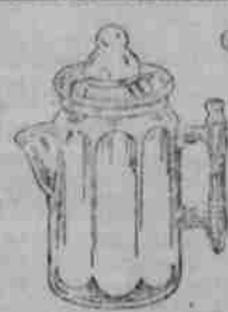
1 1/2 QT. PANELLED COFFEE PERCOLATOR