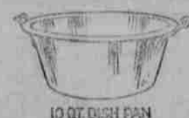
10 QT. DISH PAN