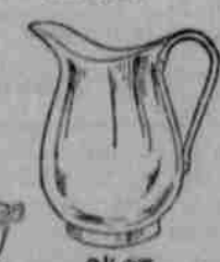
2 1/2 QT. WATER PITCHER