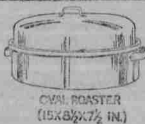
OVAL ROASTER (15x8 1/2 x 7 1/2 IN.)