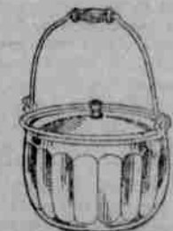
4 QT. PANELLED COLONIAL KETTLE