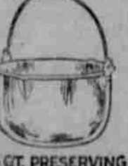
6 QT. PRESERVING KETTLE

SALE STARTS AT EXACTLY 10 A. M. SATURDAY, JULY 19th