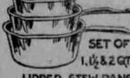
SET OF 1, 1 1/2 & 2 QT. LIPPED STEW PANS