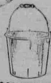
8 QT. WATER PAIL