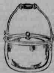
6 QT. COLONIAL KETTLE