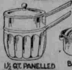
1 1/2 QT. PANELLED DOUBLE BOILER