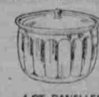
4 QT. PANELLED COLONIAL SAUCE PAN