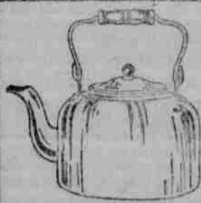
5 QT. TEA KETTLE