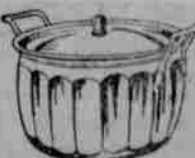
6 QT. PANELLED PRESERVING KETTLE