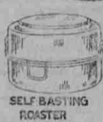
SELF BASTING ROASTER