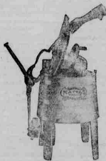
MAYTAG HAND-POWER WASHER

THINK! A real Maytag Washer at new laid prices. Can you find such remarkable reductions on any other household article? Can you buy anything else at half its value—its wonderful helpfulness—at such a drastic price cut?