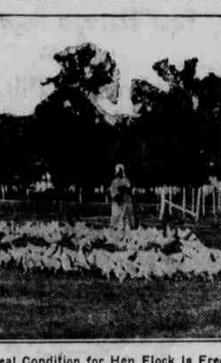
Ideal Condition for Hen Flock is Free Range.

UTILIZATION OF FARM LAND Value of Place Depends Upon What Proportion of Total Area Can Be Made Productive. Effective utilization of farm land means a high percentage of income-producing area, say specialists of the United States Department of Agriculture. The value of a farm depends upon what proportion of its total area is productive. Compare a farm of 100 acres at $200 an acre, 95 acres being in shape to yield available products, with another farm of the same acreage at $150 an acre, but with only 65 productive acres. If all the other features of the two farms are similar, the former should be the most profitable because its profit-producing land costs but $120 an acre against $230 an acre on the second farm.