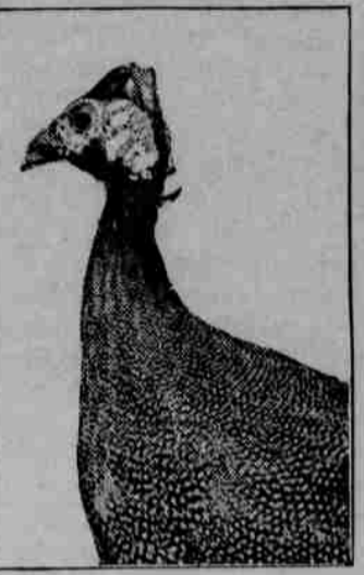
Prime Young Guinea Are a Special Delicacy.

Value as Substitute for Game Birds Becoming Better Recognized by Many People. The value of a guinea fowl as a substitute for game birds such as grouse, partridge, quail, and pheasant, is becoming more and more recognized by people fond of this class of meat, and the demand for these fowls is