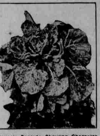
Brussels Sprouts, Showing Characteristic Feeding Areas, White Spots on Leaves, Due to Attack of the Harlequin Cabbage Bug.

(Prepared by the United States Department of Agriculture.) The cabbage crop of many states suffers severe losses from the ravages of the harlequin cabbage bug. The affected plants wilt and die soon after attack as though swept by fire, hence the name "fire bug." This bug, which also is called "calico bug" and "terrapin bug," also injures cauliflower, kale, turnip, radish, and other cole crops, and after destroying fields of these, attacks various other vegetables. Several generations are produced each year. Cleaning up the cabbage stalks and other remnants as soon as the crop is off, preventing the growth of weeds