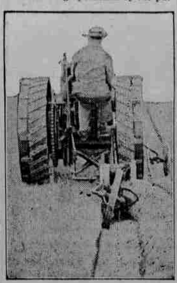
Farm Tractor at Work.

Men who hope to reduce greatly the cost of farming operations by the purchase of a tractor should bear these facts in mind. Judging by the experience of tractor users, it is not safe to expect any material reduction in the cost of farm operations per acre through the use of the tractor, but it is safe to expect to be able to increase the crop acreage to a very considerable extent, and at the same time, the amount of crops which one man can raise.