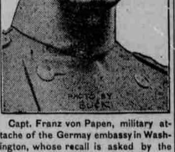
Capt. Franz von Papan, military attaché of the German embassy in Washington, whose recall is asked by the State department.

CAPT. WILLIAM S. SIMS. Capt. William S. Sims, U. S. N., will command the great battleship Nevada, which recently underwent her trial tests off Rookland, Me.