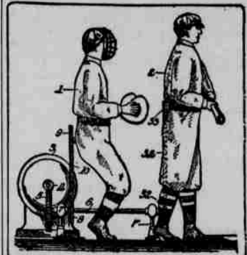
The Baseball-Playing Dummies and the Mechanism That Makes Them Work.

A machine for practicing baseball, devised by an Ohio inventor, has two life-size figures that take the part of batter and catcher. An electric motor puts "life" into their movements. Rods, levers, joints and springs contained within the bodies of the dummies cause them to maintain automatically