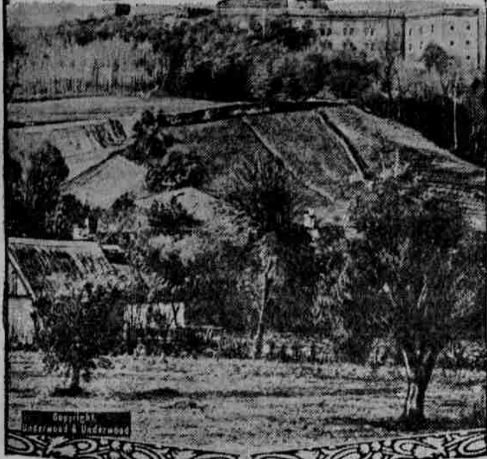
ANCIENT CITADEL OF CRACOW

B Y THE broad Vistula river, on ancient Poland's soil, lie two famous age-torn cities, around which have centered the rise and fall of one of the mightiest nations in history. Before their gates and within their walls have been fought the battles of armies unnumbered and for a thousand years they have known the sorrow of death and destruction—and oftentimes the glories of victory. In the valley of the stream whose banks they adorn a new conflict is raging today. On the outcome of this struggle may rest their fate in the years that are yet unborn, says the Philadelphia Record. Cracow and Warsaw, the cities are—one the capital of Poland's kings when the nation was in its prime; the second the home of that glorious hero, Kosciusko, who led the people in their bloody war for independence after invaders had seized their land. Through the centuries of their country's prosperity and the dark years of grief the beautiful old towns have nurtured and cherished the ideals of the Polish people, and today they house the only remaining relics of that once proud nation which long since ceased to exist.