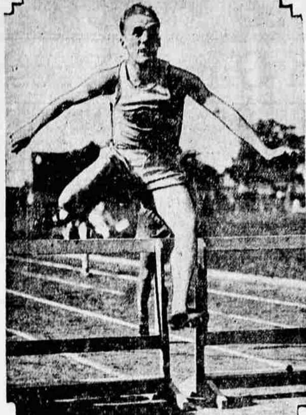
F. Morgan Taylor of the Illinois A. C., former Grinnell College star, made the record time of 53 and 1-10 seconds for the 400 metre hurdles at the Olympic tryouts at Detroit. The former Grinnell star is assured of a berth on the team which will compete at Amsterdam.