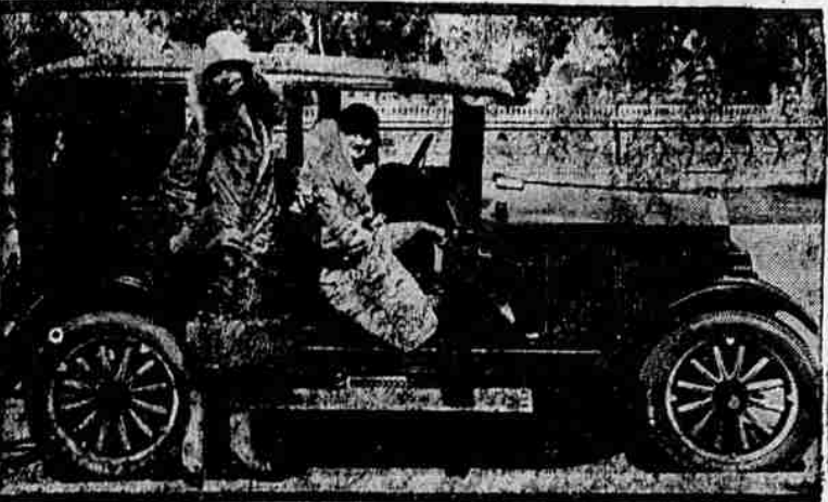
Increasing popularity is creating a demand that leaves many orders unfilled for the new Star six cylinder models, one of which is shown here, the coach type. According to Star car dealers all over the west, the six has been an instantaneous success, and is a fitting performance companion for the famous Star four.