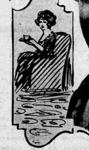
as their annual formal dance. The chapter members received their guests in the woman's building, and a large group of Eugene and out-of-town alumni, high school and university guests were bidden for the dance.

One of the most elaborate and unique affairs ever given on the campus was the court ball, which Chi Psi men presented Friday night