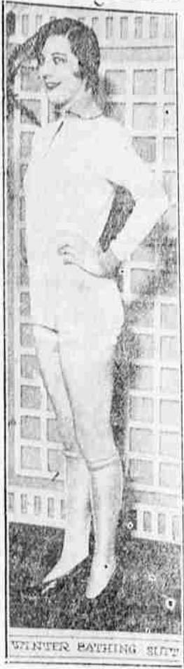
WINTER BATHING SUIT The woolen suit, with the split turtle neck, is the latest in winter beach attire that will be worn by the tonables in California and Florida.