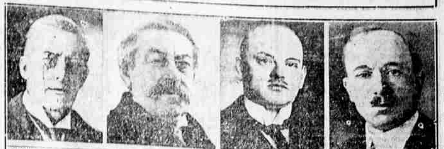
ALFRED CHAMBERLAIN, ARISTIDE BRIAND, DR. STRESEMANN & DR. BENES