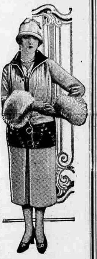
THE flare and flutter of the winter mode has definitely replaced the vogue for things masculine in line and detail. The lavish use of furs on dresses, suits, coats and wraps share with the flare the honor of bringing the feminine trend back to popularity.

Selecting Your Turkey for Christmas Plenty of Flesh on Fowl Means Plenty of Meat for Carving and There Should Be Generous Amount of Fat. When you select your turkey for Christmas, one of the chief considerations is the amount and quality of flesh on the body, especially on the breast, back and hips. Plenty of flesh means plenty of meat for carving and there should also be a generous amount of fat to insure a moist, tender turkey. The French always expose a turkey in the market with the back up so the housewife can better observe how plump the bird is. Feeling the end of the breast or keel bone and examining the spur on the feet may give some idea of