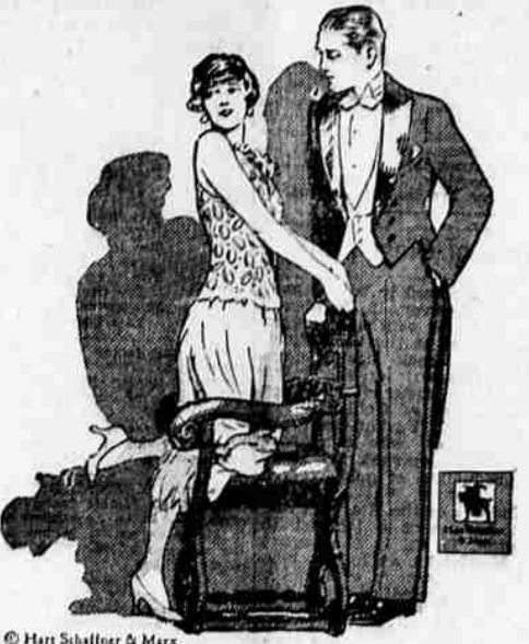
Dinner Suits. For holiday and winter functions. Plain and self figured fabrics, richly trimmed and faced with fine satins.

All kinds of refuse collected and disposed of. Telephone 2232-R. Independent Garage.