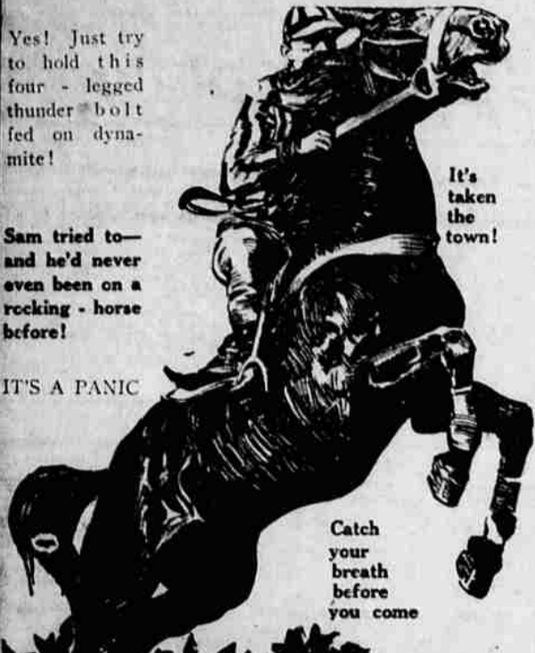
It's taken the town!