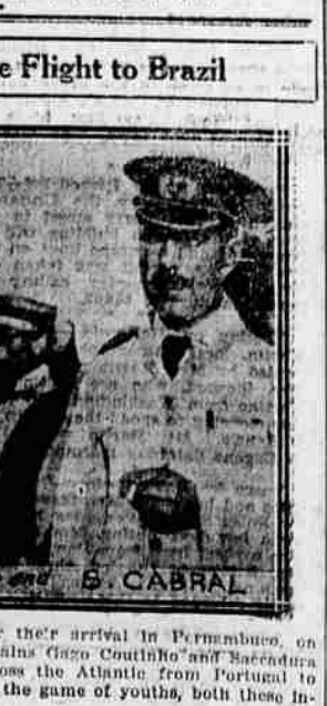
Capt. Cabral, photographed immediately after their arrival in Pernambuco, on the completion of their long flight across the Atlantic from Portugal to Brazil. Though flying is supposed to be the game of youths, both these intrepid naval aviators are past 50.