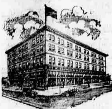
New York Office 1170 Broadway

—Women's Black Lisle Out Size Hose in sizes 8½ to 9 only. This hour 35c pair. Regular 75c.