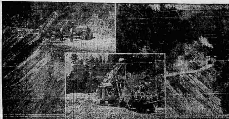
The beautiful Wawona Road in Yosemite, which has been more or less eclipsed by the Briceburg All-Year route, is to come into its own again as one of the most modern of the Sierra highways. With out destroying any of its grandeur, highway engineers are changing the old sharp turns and steep grades into a wide, easy-grade mountain road. The pictures show construction work on the new road.

ter Wawona Road—will be a boon to the Wawona section, and will offer an alternative to the Briceburg all-year road. Great care is being taken to preserve all of the beauty and grandeur that Mother Nature has bestowed on the route. The new road will equal if not exceed the present route in charm, it is promised.