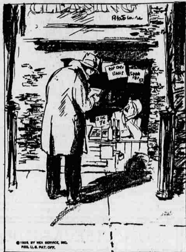
"We're getting the indorsement of all the merchants in this neighborhood, and we'd like to have your name on the list."