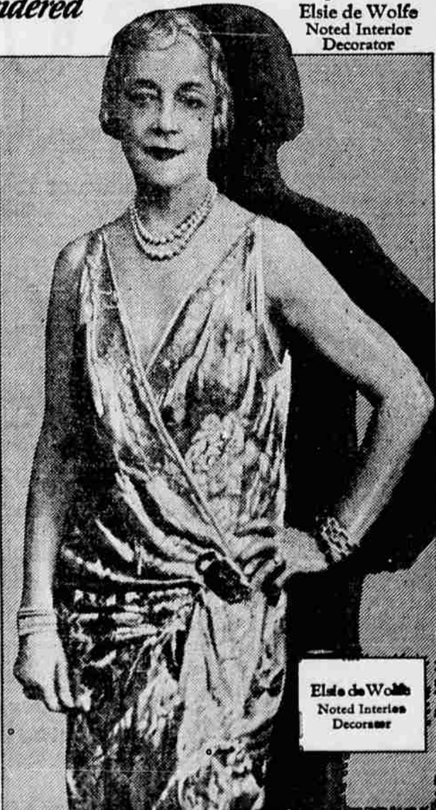
Elsie de Wolfe Noted Interior Decorator