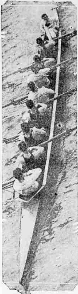
Naval University crew, which defeated University of Washington at Poughkeepsie.