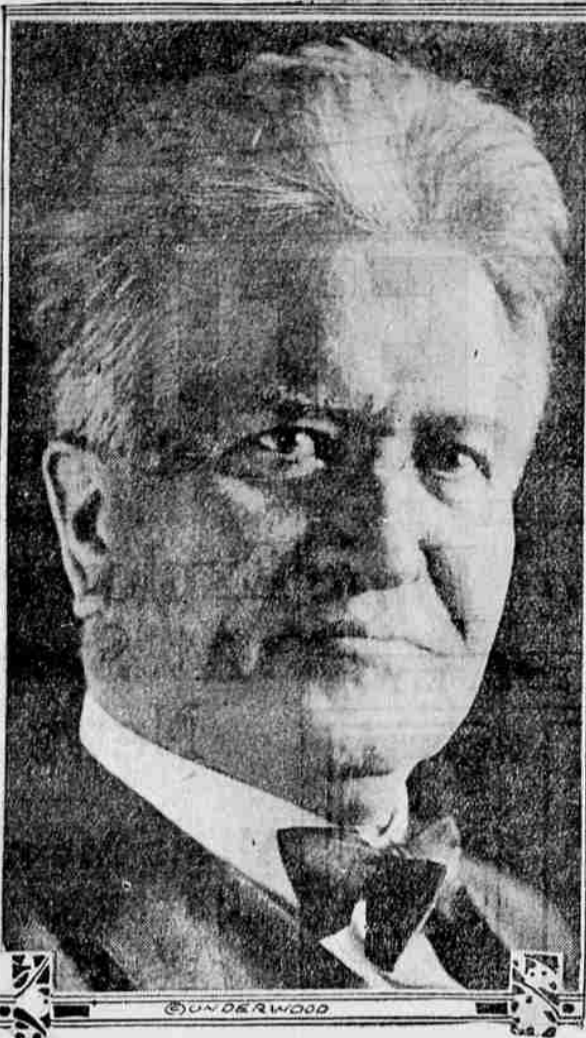
Robert Marion LaFollette