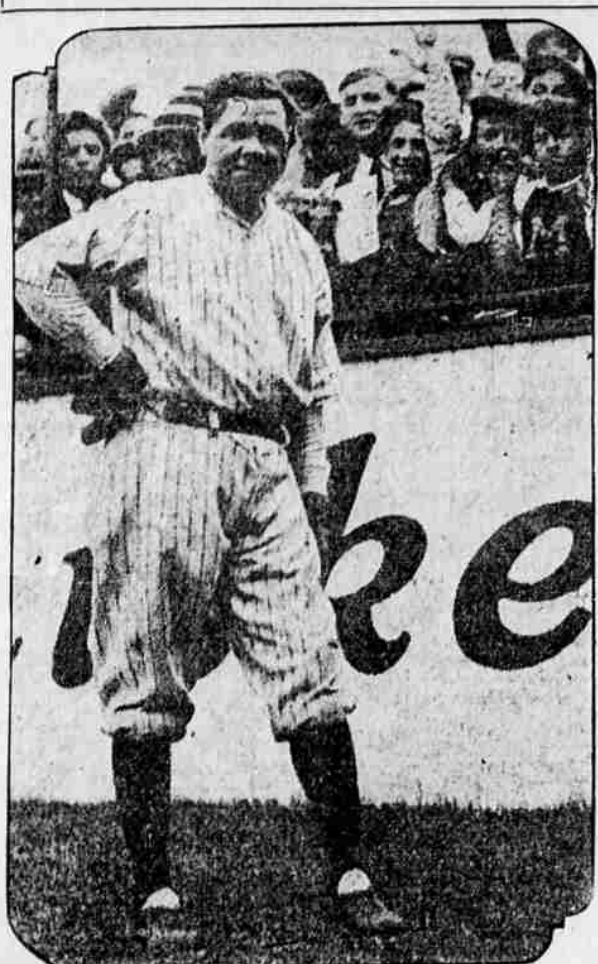
What a cheer greeted Babe Ruth when he once more took his place in right field for the Yankees, especially from the kids! Here he is, still a little weak, but back at the old stand.

play on it and rolls a considerable distance away.