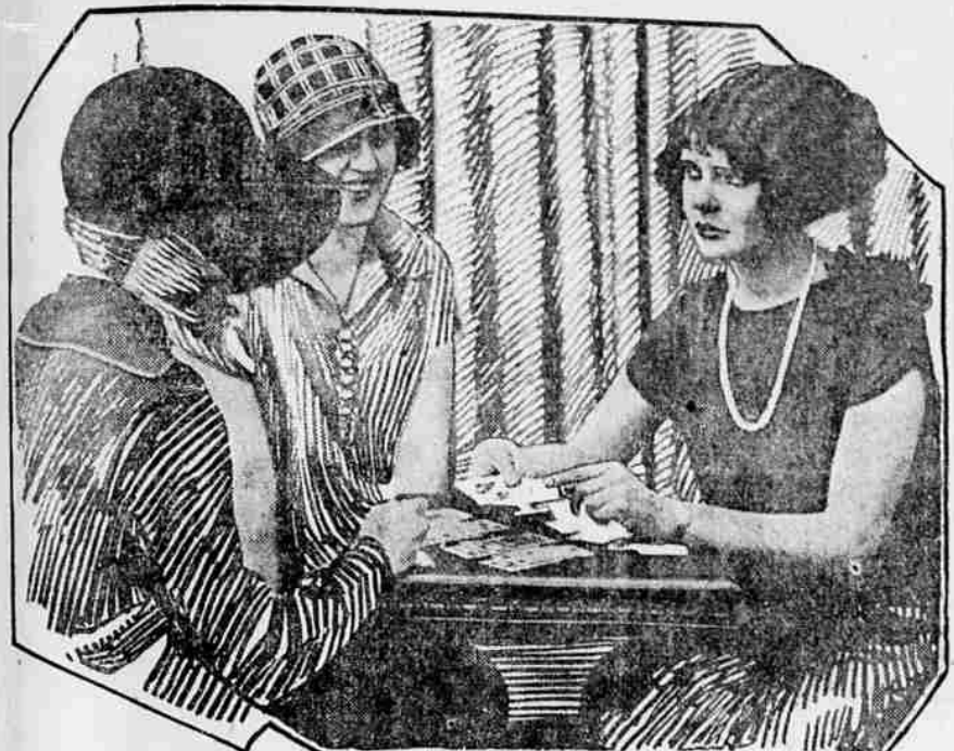
"You poor simp!" Gloria flamed at her, "to make a bid like that when you had a bust hand!"

by Beatrice Burton © 1925 NEA SERVICE INC