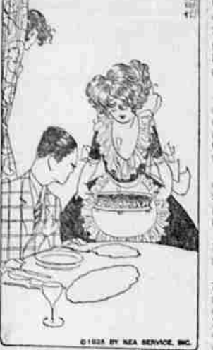
Warmed over dinners make love grow cold.

Two red spots of color rose in Gloria's face. All her anger toward Stanley Wayburn and Myra gathered like a cyclone. In its path, Lola stood quite defenseless. "You poor simp!" Gloria flamed at her, "to make a bid like that when you had a bust hand!" "I should think you'd learn a few rules of the game, if you're going to even make a stab at playing bridge!" All the color drained out of Lola's cheeks. If Gloria had slapped her face she couldn't have hurt her more. She put one hand on the table and rose. Every woman in the room was looking at her. "I'm sorry," she said. "Perhaps I shouldn't play cards with people like you, who never forget that there's a prize at the end of the game. I don't play a professional game like yours!" May came across the room. "Please, girls, don't quarrel," she said, trying to push Lola down in her chair. "Do sit down, Lola, and go on with your game." But Lola was firm. "No," she said with a breaking voice. "I'm going. There's no use in my trying to keep up with you girls. . . I don't have time to play often enough to keep my wits sharp. And I shouldn't have come today."