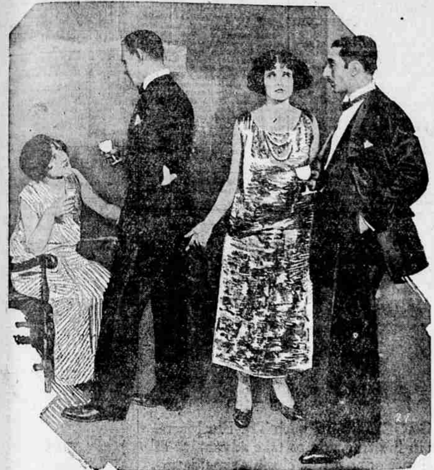
"Whatever you do, don't pay any attention to me, tonight," she said.