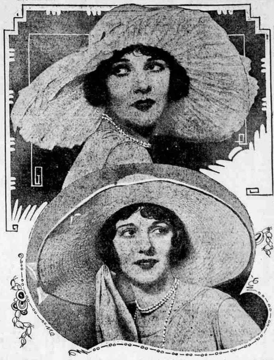
The small hat, so popular for several seasons, will be buried this summer under an avalanche of large, lacy hats...

Delicate Rainbow Tints to be Popular For Both Hats and Frocks During Coming Warmer Season