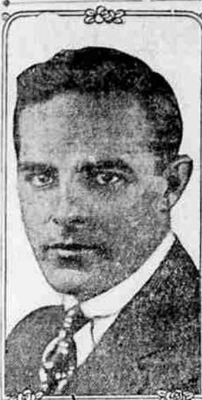
Adolph Zukor, president of Famous Players-Lasky corporation, who is attending the international Paramount convention at the Hotel Ambassador, predicted today that next season would be the one of the most successful in the history of the motion picture business.

experience has shown the public will patronize. "Despite the stupendous task involved, we have laid out our program of productions not only for the six months following, although at this time we are announcing only the attractions which we will release in the six months from August 1 to February 1. Thus, the exhibitor knows now what the Paramount production program will be for the year to come and can make his plans accordingly."