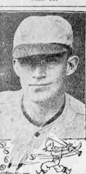
Leo Hartnett Here's the fellow who has been raising particular havoc with pitchers in the National League so far this season. He's Leo Hartnett, stellar catcher of the Chicago Cubs. During the first week of the chase he turned in six home run drives, pretty good for a starter. He hopes to keep up the good work, too.