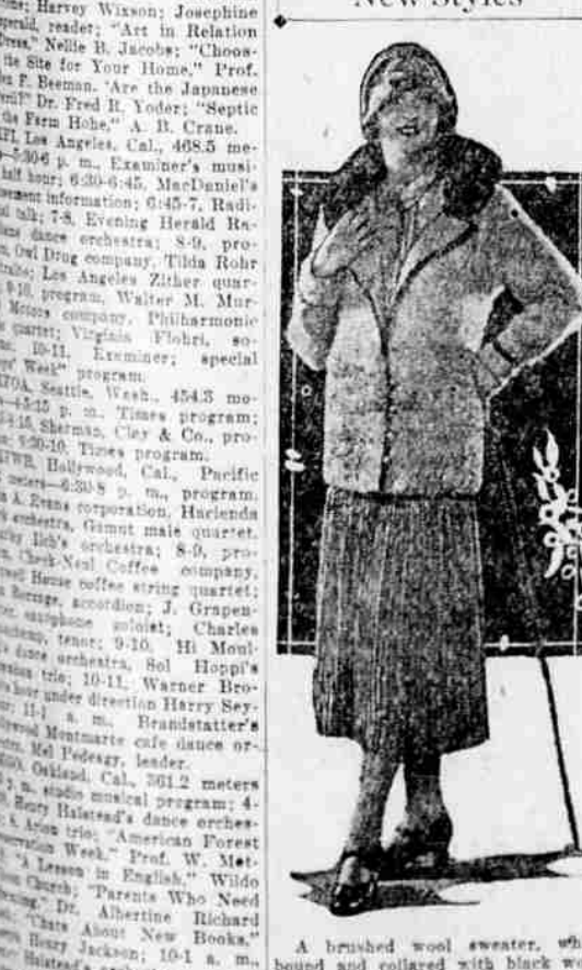
A brushed wool sweater, white bound and collared with black wool, is very much liked for spring days. It is worn with a tailored blouse and pleated skirt.